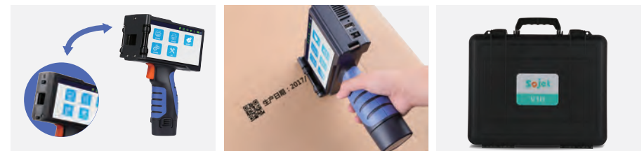
Free combination and replacement between Two wheels and four wheels